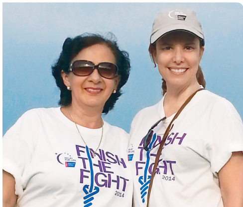
The Methodist Richardson Cancer Center team participated in the American Cancer Society Relay for Life – Richardson/Plano on May 9.